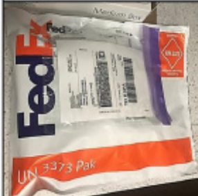
Step 8. Sample is ready to be dropped off at your nearest FedEx

Place the pre-paid return address label in the sleeve on the outside of the envelope.