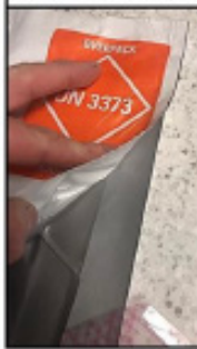
Step 6. Seal FedEx envelope