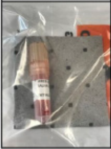
Step 1. Place sample in biohazard bag