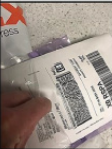
Step 7. Place return label into the sleeve

Seal the envelope by removing the adhesive tape.