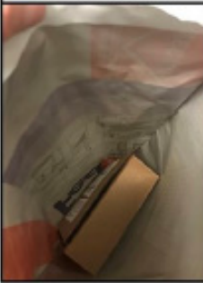
Step 5. Place box in FedEx envelope

Close the lid of the box. No seal or tape is needed.