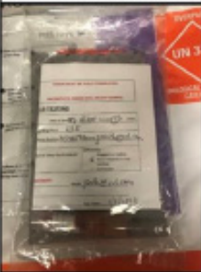
Step 2. Include the requisition (front pocket)

Place saliva tube in the biohazard bag that contains the absorbent pad and seal the biohazard bag by removing the adhesive liner and pressing close.