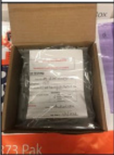
Step 3. Place bio-bag in box

Fold and place the signed requisition form in the front pocket of the biohazard bag (non-sealable).