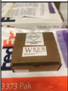
Step 4. Close lid of box

Put the biohazard bag (which contains your specimen) into the cardboard box.